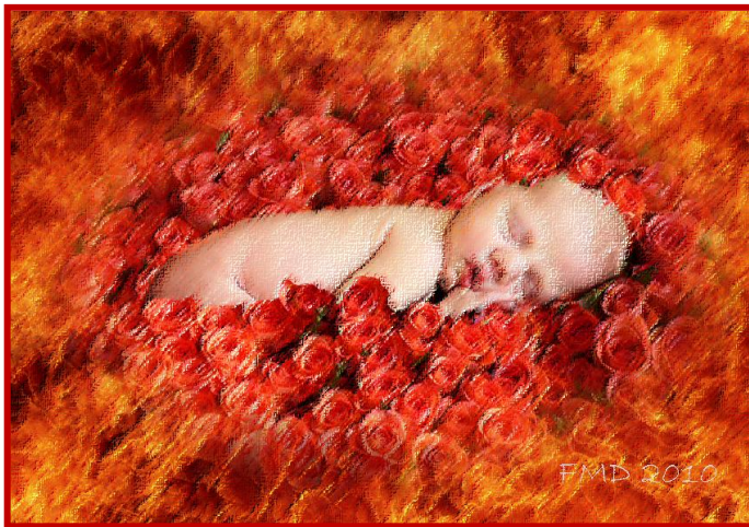
Bed of Roses – FMD [Inspired by the legend of baby Zarathushtra's miraculous survival in a fire]

Mah Farvardin, Roj Khordad (March 26) celebrates the birth of Asho Zarathushtra